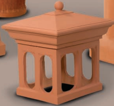
◐ Tuscan ◐ 31" Tall