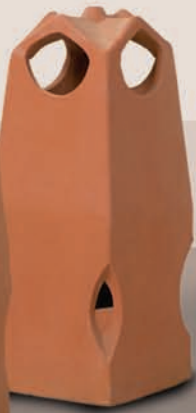
★ Excalibur ★ 36" Tall