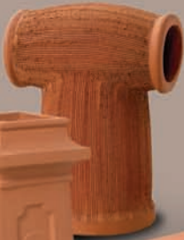
★ Belair ★ 29" Tall