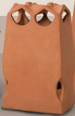
◆ 13 x 18 Excalibur 36" Tall