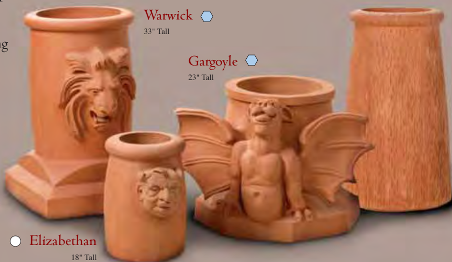
Elizabethan 18" Tall