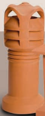
■ Mandatory 31" Tall