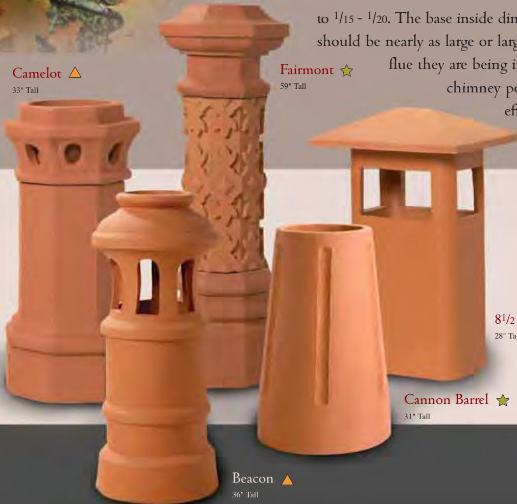
Beacon ▲ 36" Tall