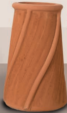
★ Hampshire ★ 32" Tall