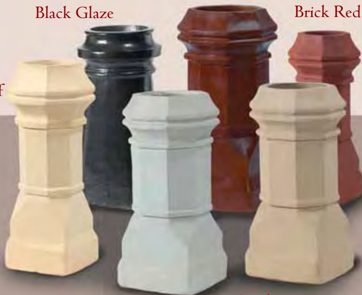
Blue Limestone (also available in Gray Limestone)