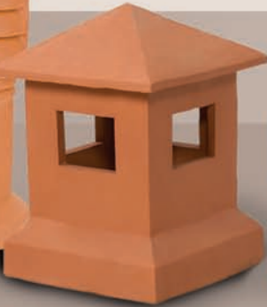
▲ Sentry 25" Tall