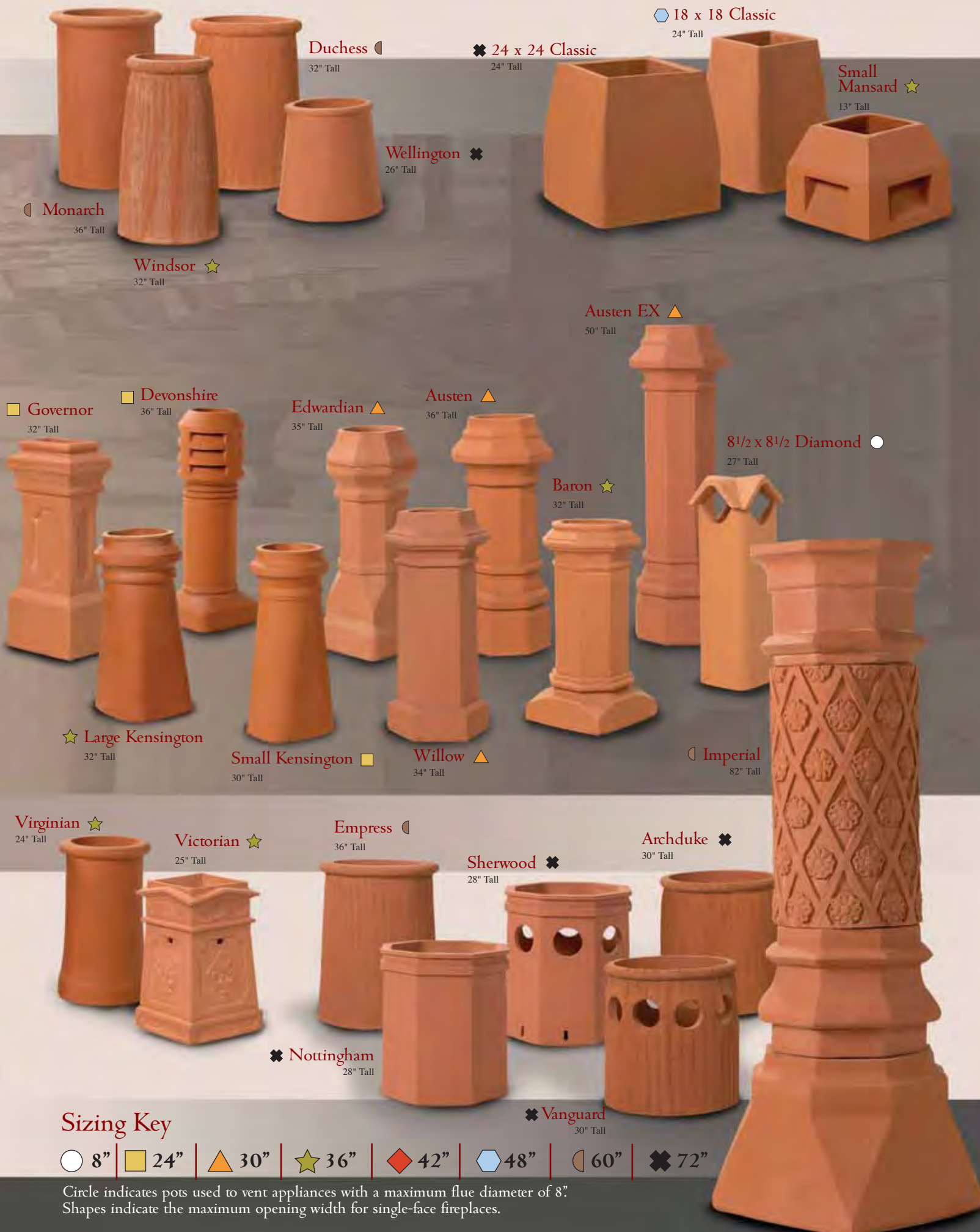
Duchess 32" Tall